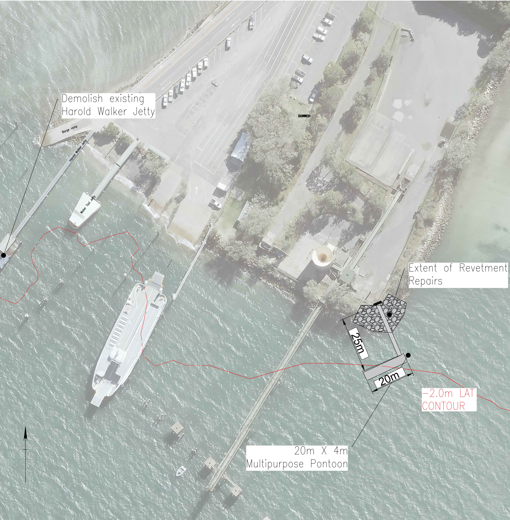
SITE PLAN Scale A