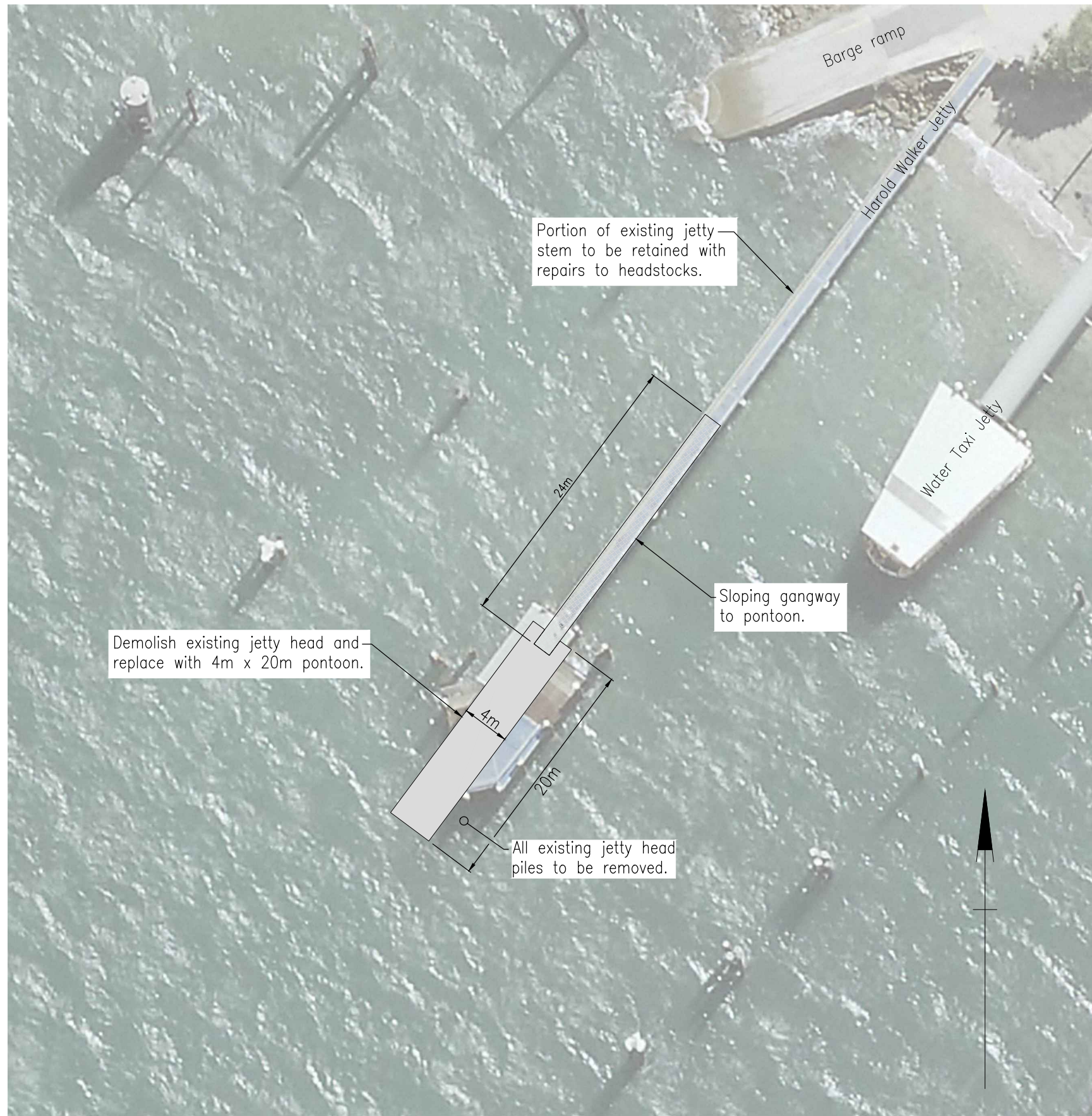
SITE PLAN Scale A