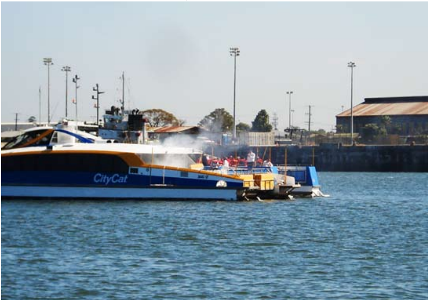
Below: Passengers in life jackets being transferred from CityCat to 'Tugulawa'.