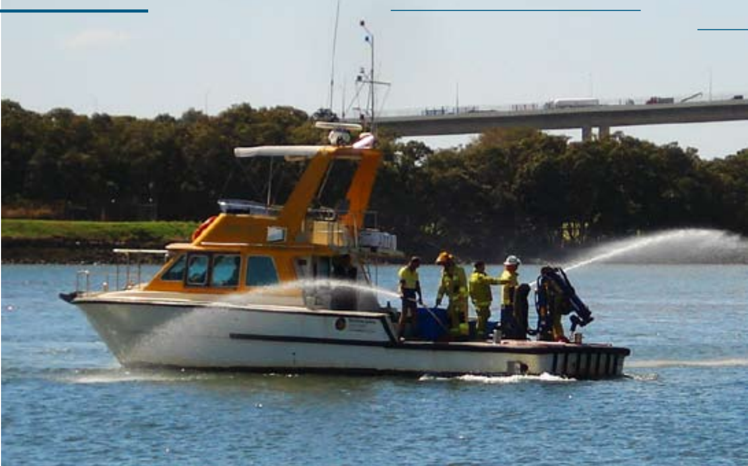
Above: Queensland Fire and Rescue Service officers demonstrating fire fighting equipment aboard Maritime Safety Queensland vessel 'George Kerr'.